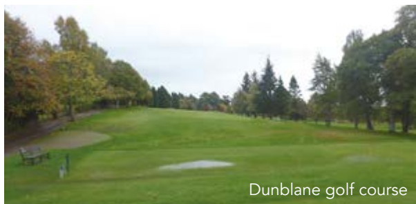
Dunblane golf course