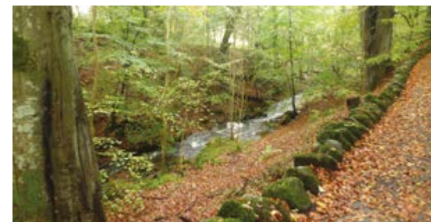
Track alongside Cock's Burn

5 Turn left, following the Darn Road as the Allan Water flows downstream on the right. After 50m cross Cock's Burn by a bridge and ford when it is in spate. Keep right and continue on the Dam Road track until reaching a street, Blairforkie Drive. Turn right downhill and upon reaching the main road at the bridge over the Allan Water, turn right and continue along this road to the Bridge of Allan Railway Station.