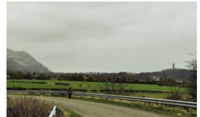
View of Wallace Monument

(If you want to visit the tidal limit of the River Forth, turn right at the bottom of the slope from the motorway bridge. Follow faint paths along a hedge line and ditch line, and then turn right along the fisherman's path for 400m to the rapids near Old Mills Farm. Retrace your steps to the minor road).