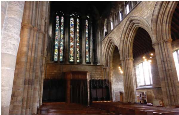
Inside the cathedral