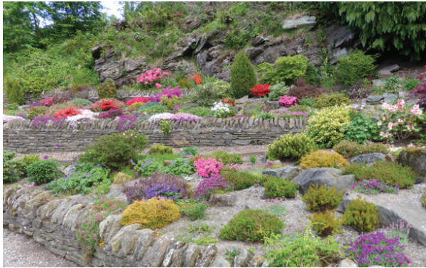
Dunblane community gardens