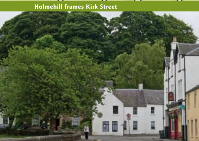
Holmehill frames Kirk Street