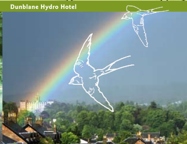
Dunblane Hydro Hotel