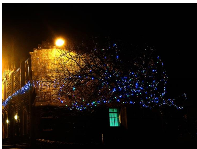
Dunblane Burgh Chambers; decorated with lights for you at Christmas by Dunblane Development Trust volunteers