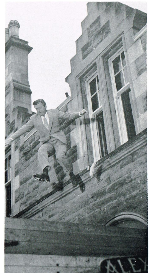
Actor Kenneth More, playing Richard Hannay, jumps from Dunblane Burgh Chambers first floor onto a passing 'charrette' (hay cart!) in the 1959 filming of John Buchan's classic novel " The 39 Steps "

Produced & distributed by Dunblane Community Council in partnership with Dunblane Development Trust, Discover Dunblane, Stirling Council and Big Lottery Awards for All